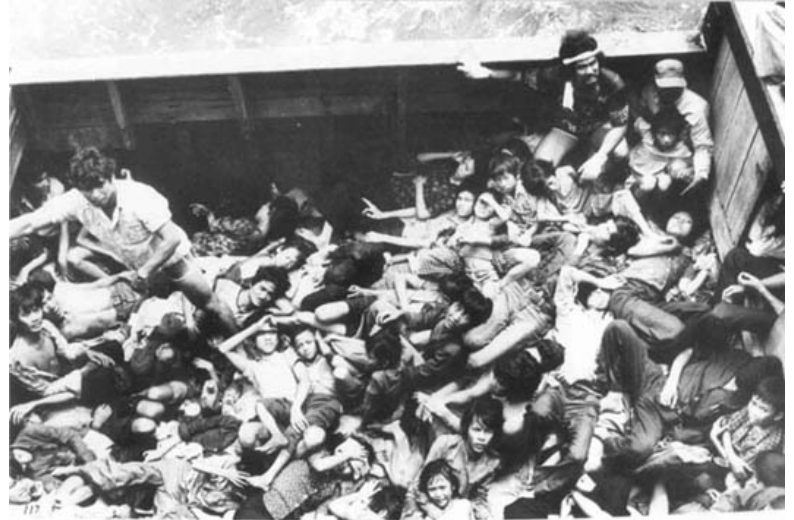
Vietnamese Boat People